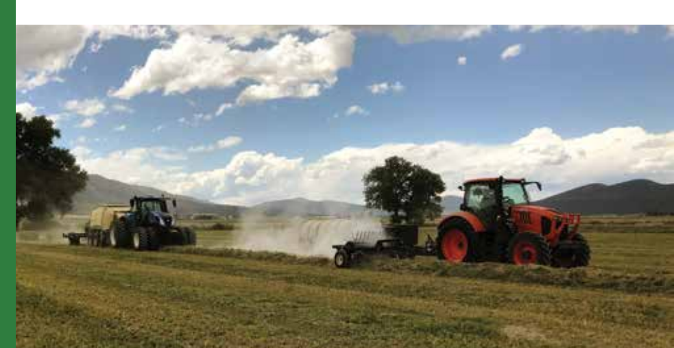
The Model 721 Dew Simulator operates as a separate pass in front of 1 Large Square Baler

The Model 721 Dew Simulator operates as a separate pass in front of 2 Small Square Balers.